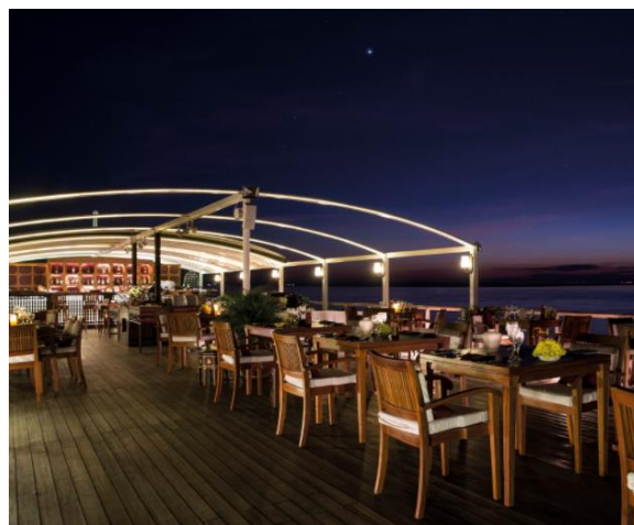
Road to Mandalay Grill

You may wish to visit Belmond's free clinic near the jetty in Old Bagan, where the doctor will be busy helping local patients. Lunch served on board. In the afternoon visit one of Bagan's most magnificent temples, Ananda . Explore a rarely-visited temple by torchlight before witnessing the sunset across the plains. Dine under the stars at the Road to Mandalay Grill on the Observation Deck, before enjoying a classical marionette performance.