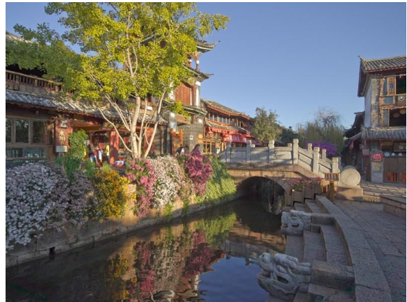
Lijiang Old Town

Famous for the orderly system of waterways and bridges, Lijiang's culture combines Ming dynasty Han Chinese traders and traditional Nakhi lifestyle.