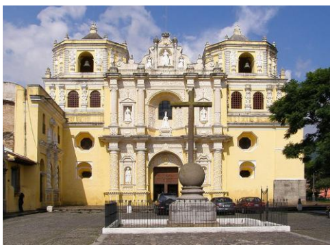
La Merced Church

Enjoy breakfast in the comfort of your hotel; day begins with your private Antigua Walking Tour . Guide shall meet you at reception; your half day walking tour will cover cultural, historical and social highlights of the colonial city with a behind the scenes look at some of the many ruined churches, convents and cathedrals.