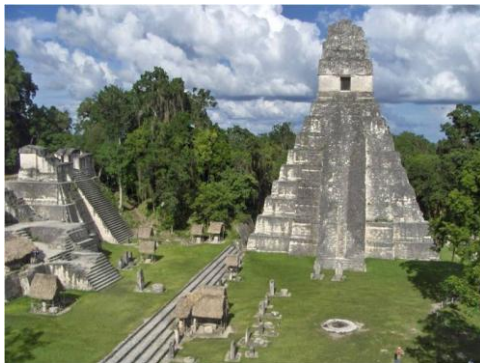
Tikal Archaeological Site

Your private tour continues with El Peten , parrots and monkeys far outnumber people while the crumbling ruins of the ancient Mayas stand in for modern cities. A large tract of this area belongs to the Maya Biosphere Reserve; a wildlife haven stretching from Belize through Guatemala to Mexico. Archaeological buffs will enjoy Yaxha, Ceibal, Aguateca, Uaxactun and the Tikal Archaeological Site .