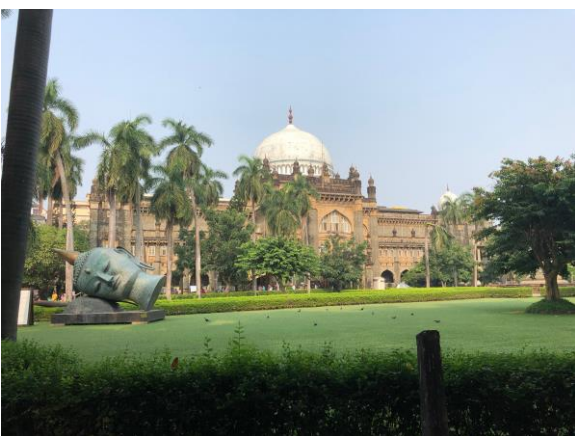
Chhatrapati Shivaji Vastu Sangrahalaya

Continue to Chhatrapati Shivaji Vastu Sangrahalaya, Flora Fountain, Victoria Terminus, St. Thomas Cathedral, Malabar Hill and Hanging Gardens . Chhatrapati Shivaji Vastu Sangrahalaya is also known as The Prince of Wales Museum , founded by prominent citizens of Mumbai in the early 20 th century to welcome the Prince of Wales.