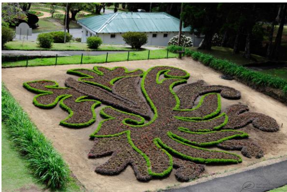
Hakgala Botanical Gardens

Visit the Hakgala Botanical Gardens , Gregory's Lake or the Seetha Amman Hindu Temple. Wander through the fruit and vegetable markets and strike a bargain at the night 'bale' market. Break up the day with a freshly brewed Ceylon tea and homemade strawberry jam on toast, or for those into golf, tee off at the Nuwara Elya Golf Club.