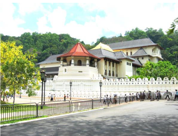
Temple of the Tooth

craftsman, known to be the most skilled in the country. Kandy can be a bustling place in the day so there is nothing quite like a late evening stroll around the serene lake with a view to the Sacred Temple and the distant sound of drums in the background.