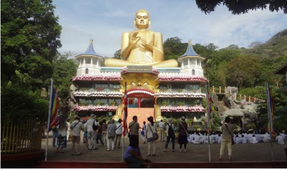
Dambulla Cave Temple

Breakfast at your hotel, check-out, drive to Kandy (80km / 03hrs) on the way visit Dambulla Cave Temple . Dating back over 2,000 years, Dambulla is a vast cave complex, converted to a rock temple still regarded today as one of the most important Buddhist monasteries. Covering the ceiling is the largest collection of paintings in Sri Lanka within a cave temple and surrounding you is the highest number of Buddha statues found in one single place.