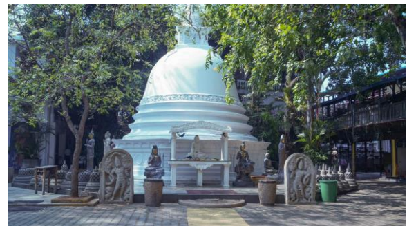
Gangaramaya Buddhist Temple

Your panoramic tour takes you past Gangaramaya Buddhist Temple , Pettah Bazaar, Wolfendhal Dutch Church, Old Parliament Complex, The Bandaranaike International Memorial Hall, Nelum Pokuna Theatre, Viharamahadevi Park, Independence Square and the National Museum. Before heading back to your hotel, take a stroll along the Galle Face green and enjoy afternoon tea or a sundowner (payable locally) at the iconic Galle Face Hotel, one of the oldest in South Asia, looking out across the glistening Indian Ocean.