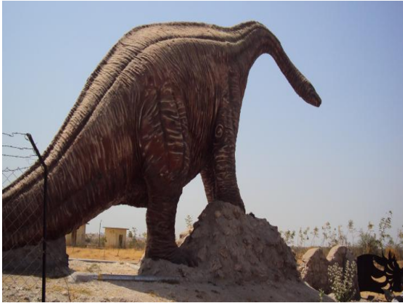
Dinosaur Fossil Park

In the morning you will arrive in Balasinor, a tiny town in Gujarat, home to one of the largest dinosaur fossil sites in the world. Palaeontologists believe that at least seven species of dinosaurs lived here and researchers have uncovered fossils of about 10,000 dinosaur eggs, making this one of the third largest hatchery in the world. This incredible site was accidentally discovered in 1981 when geologists were conducting a mineral survey of the area.