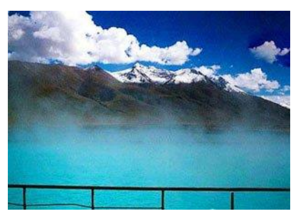
Yangpachen Hot Spring

After breakfast, check-out, airport transfer or train station transfer for your onward journey.