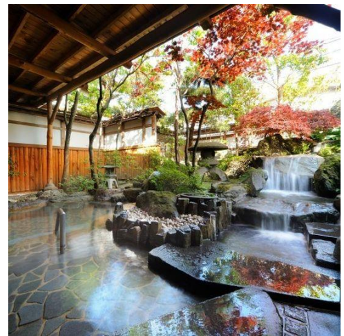
Asamushi Hot Spring