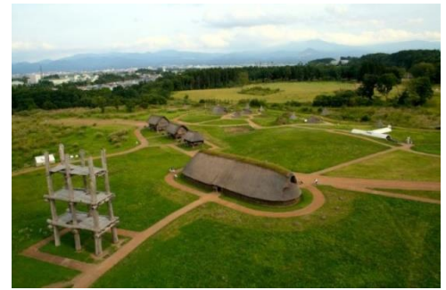
Sannai Maruyama Historical Site