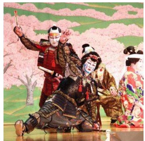
Fishermen's Kabuki Performance