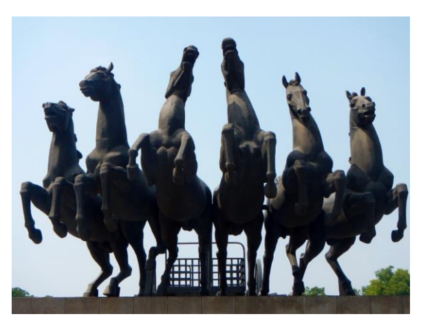
Emperor Carriage Museum

After lunch you will be escorted to Guanyu Temple , built to commemorate the great General Guan Yu of the State of Shu during the Three Kingdoms Period. Explore the only complex combining a forest with a temple in China, many believe that the head of General Guan Yu was buried here. The structure is comprised of halls, pavilions, temples and Guan Yu's tomb, valuable stone tablets with detailed calligraphies can be seen.