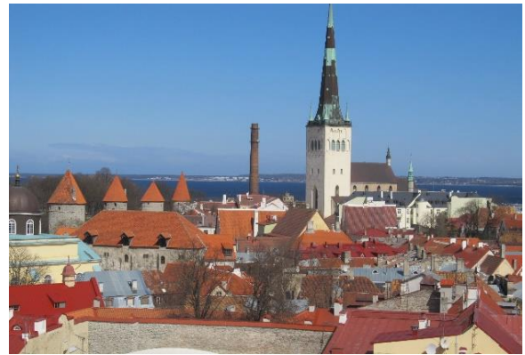
St. Nicholas Church

Return to Old Town for a walking tour (approx. 1.5hrs) that includes Lower Town, Gothic Town Hall, St. Nicholas Church, Museum of Medieval Art and the Pharmacy which has been opened since the early 15 th century!