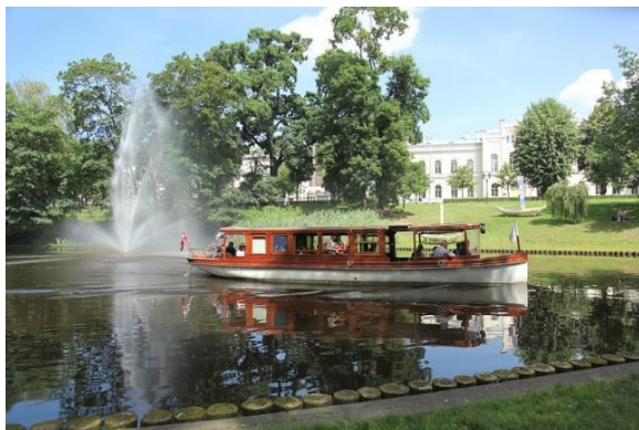
River Daugava Canal Boat

In the afternoon you will be escorted to the Art Nouveau District famous for exclusive early 20 th century architecture styles. See Riga's Art Nouveau museum to learn about the inhabitants of Riga and their heritage.