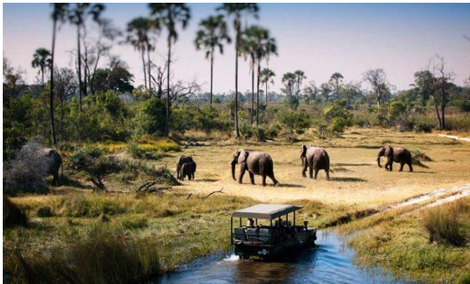
Tarangire National Park

After breakfast depart from Karatu to Tarangire National Park for a day game with your picnic lunch boxes.