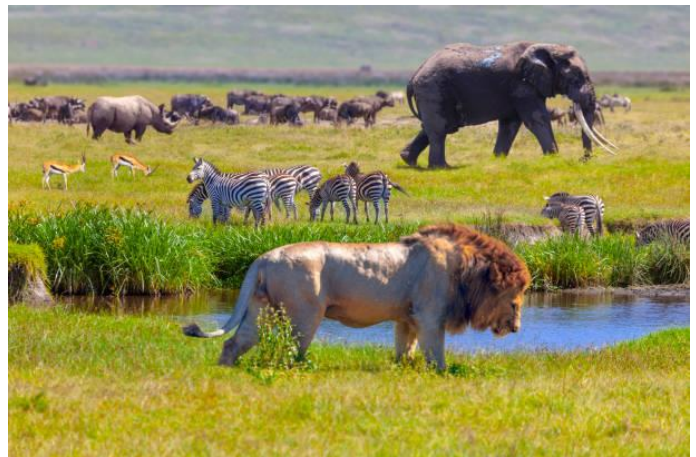
Serengeti National Park

Meals included: Breakfast, lunch and dinner.