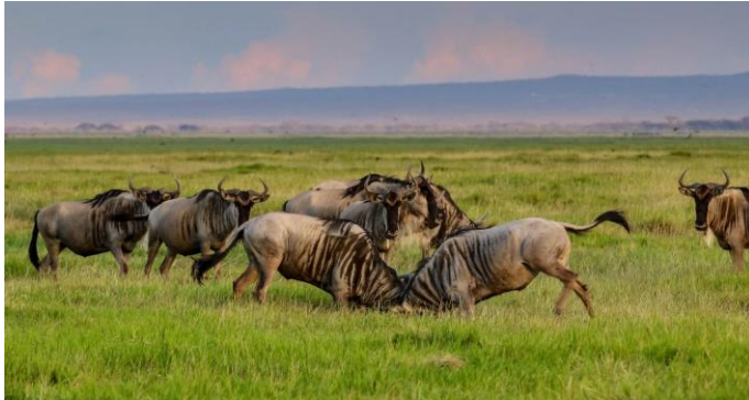
Serengeti National Park

Depart After breakfast with picnic lunch boxes for the Kenya Tanzania border.