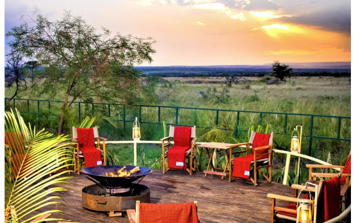
View from Zebra Plains Camp

Overnight: Zebra Plains Camp. Meals included: Lunch and dinner.