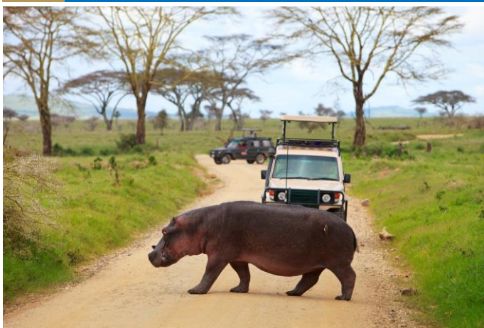
Serengeti National Park

Breakfast at the camp then depart for an extended morning game drive in Serengeti.