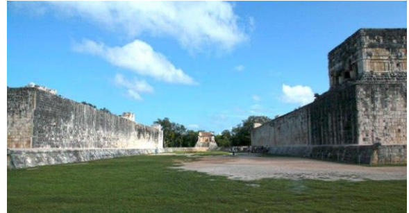
Ball Game Court

Your archaeological guide will escort you around Chichen Itza who will explain the historical significance of the most important temples. Highlights include the Observatory, Nunnery, Temple of Kukulcan, Ball Game Court, Temple of the Jaguars and Temple of the Warriors.