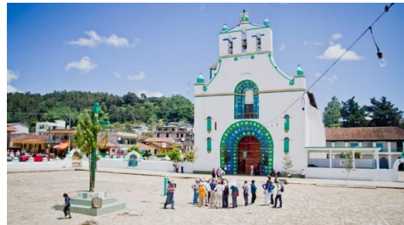
San Juan Chamula

Breakfast at hotel, head to San Cristóbal de las Casas centre, the capital of the state until 1892, still considered the cultural capital of Chiapas. Visit San Juan Chamula , famous for the mysterious church and Zinacatan , recognized for the precious textiles works.