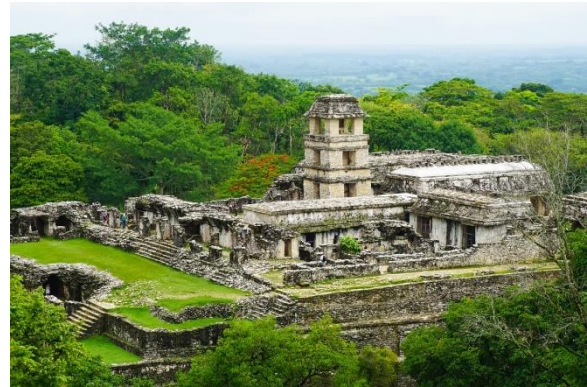
Palenque Archaeological Site

Enjoy breakfast at your hotel, your private tour commences with Palenque Archaeological Site known for exceptionally conserved architectural and sculptural remains. The elegance and craftsmanship of the construction, as well as the lightness of the sculpted reliefs depict Mayan mythology.