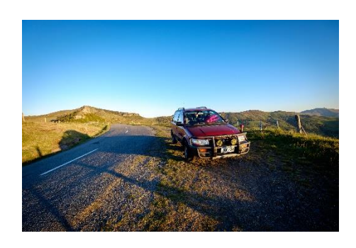
19/2 DAY ELEVEN QUEENSTOWN – HONG KONG (VIA SYDNEY)

At noon transfer to the airport for your flight to Sydney by QF 122 at 3:30 PM. Arrive 4:35 PM and connect to CX 138 at 10:20 PM.